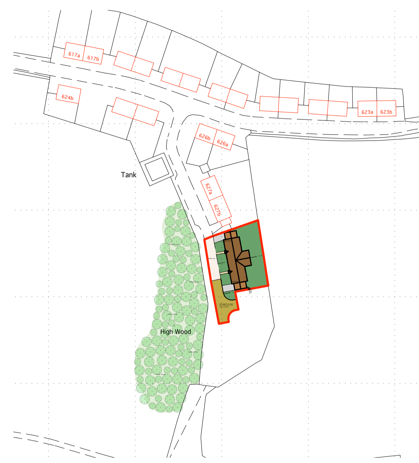
site location plan 1:1250

ThurlowArchitects the studio 61 hardwick lane bury st edmunds suffolk, ip33 2rb t: 01284 706805 info@thurlowarchitects.co.uk www.thurlowarchitects.co.uk